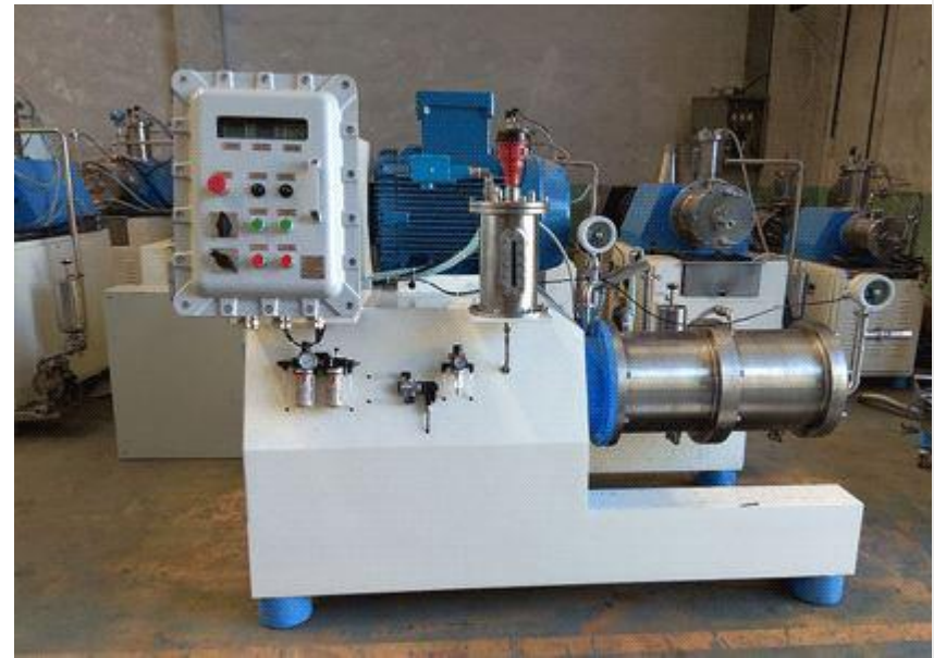
Bead Mill Machine Disc Type