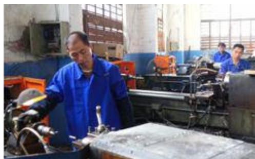
Fine process center