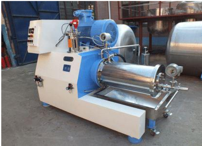
Bead Mill Disc Type