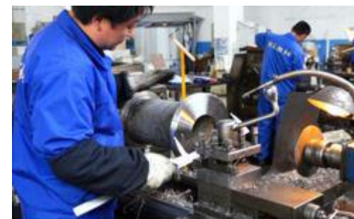
Fine process center